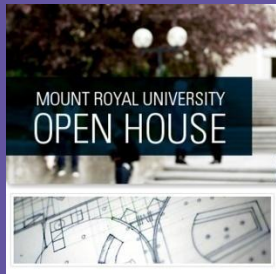
MOUNT ROYAL UNIVERSITY OPEN HOUSE

Gala Event "CaTwalk 2010: outside.the.box" So-you-think-you-can-dress? Retract the claws and enjoy. You are invited to an exclusive celebration of individual style. If you want to audition to "catwalk", come early and bring a few of your favourite outfits to showcase. For a week before the show, you are challenged to move outside the box on a scavenger hunt that raises awareness of local fashion designers. Details on facebook. FRIDAY Marquee Room, upper level, The Uptown 612 8 Ave SW 7 to 9 PM